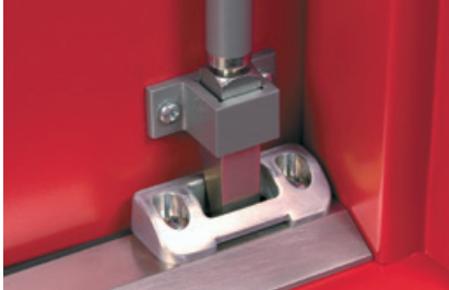
376MDS metal door strike For vertical panic bolts. Comprises 2 strike plates and 1 trip plate to activate the top tripper.