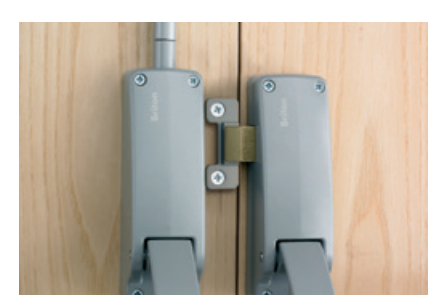
378DDS - Double door strike For use on double rebated door applications. Supplied as standard with Briton 377.