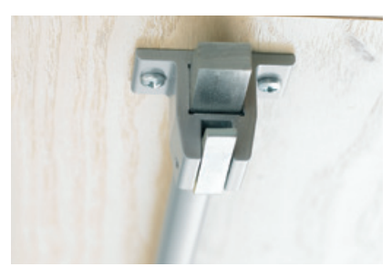
376ELTS - Extra long top shoot

A range of additional or alternative components is available for the 376 Series of exit hardware.