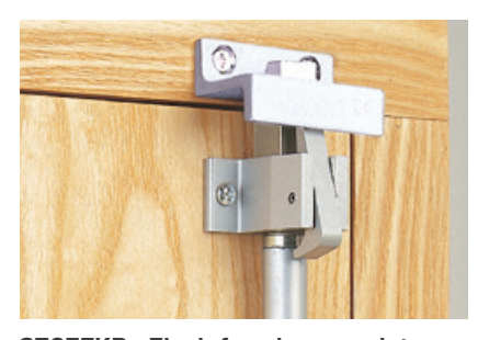
376FFKP - Flush face keeper plate For applications where there is a flush head frame a flush face keeper plate can be used to secure the bolt.

Suitable for doors that require the push bar to be in a lower position e.g schools. It can also be used on doors up to 3350mm high.