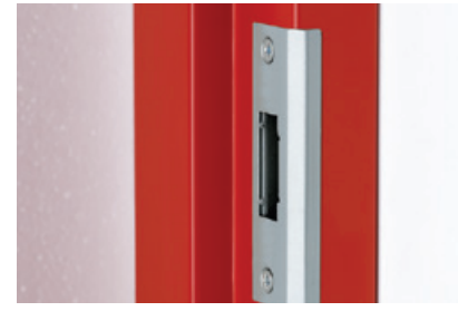
379MDS metal box strike For use with Briton 379.N mortice panic nightlatch.

For customers who prefer machine screws, alternative fixing packs are available.