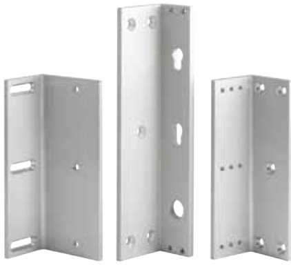
L and Z Brackets