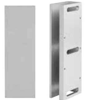
Glass Door "U" Bracket

The Lockwood Padde Series Electromagnetic Lock range offers a number of accessory options. These accessories allow the electromagnetic locks to be used in a number of different applications and can be adjusted and suited to each situation. This allows the installer to configure the door as required allowing user specific features such as open in / open out selection or glass door applications. Lockwood's Electromagnetic Lock accessories meet or exceed local and international standards, providing safe and secure locking.