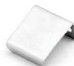
Polished Stainless Steel