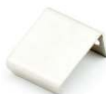
Satin Stainless Steel