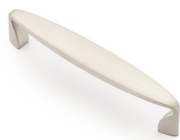
Dull Brushed Nickel