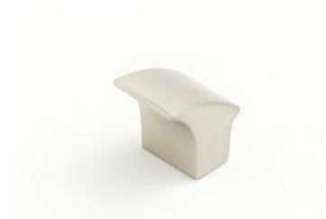
Dull Brushed Nickel