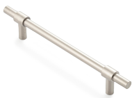
Satin Stainless Steel