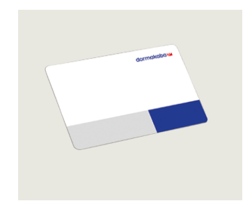
RFID card, customisable