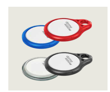
RFID key fob, design A (budget)

Elegant, glossy with slightly curved surface finish. Solid, tear-resistant stainless-steel frame. Impact-resistant polycarbonate cover.