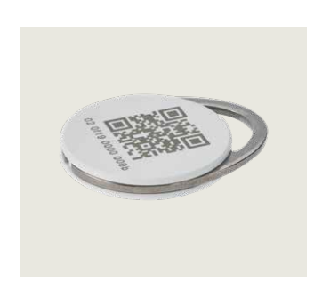
RFID tag, design G (plain)