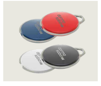
RFID fob, design V (shine)

Robust matt, flat surface, ability to apply QR codes. Solid, tear-resistant stainless-steel frame. Impact-resistant polycarbonate cover.