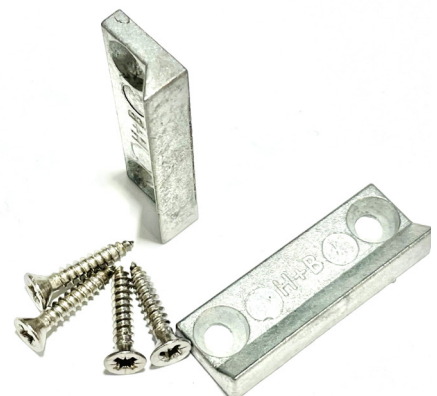
HB 1410 Timber Fixing Kit on timber doors