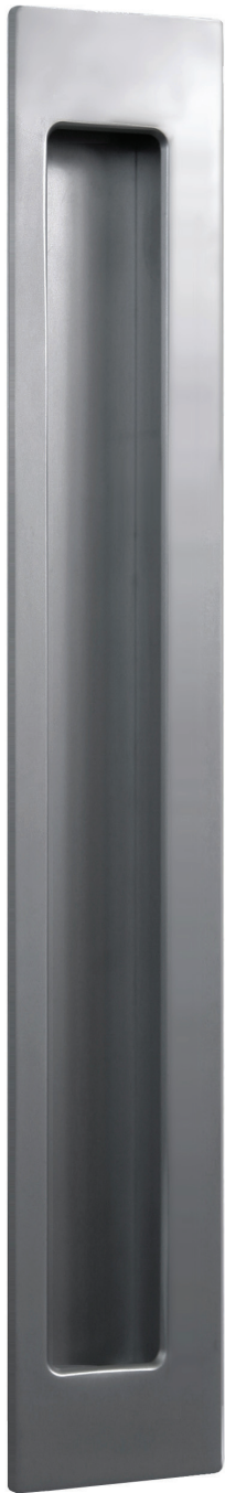
Left Hand Pull