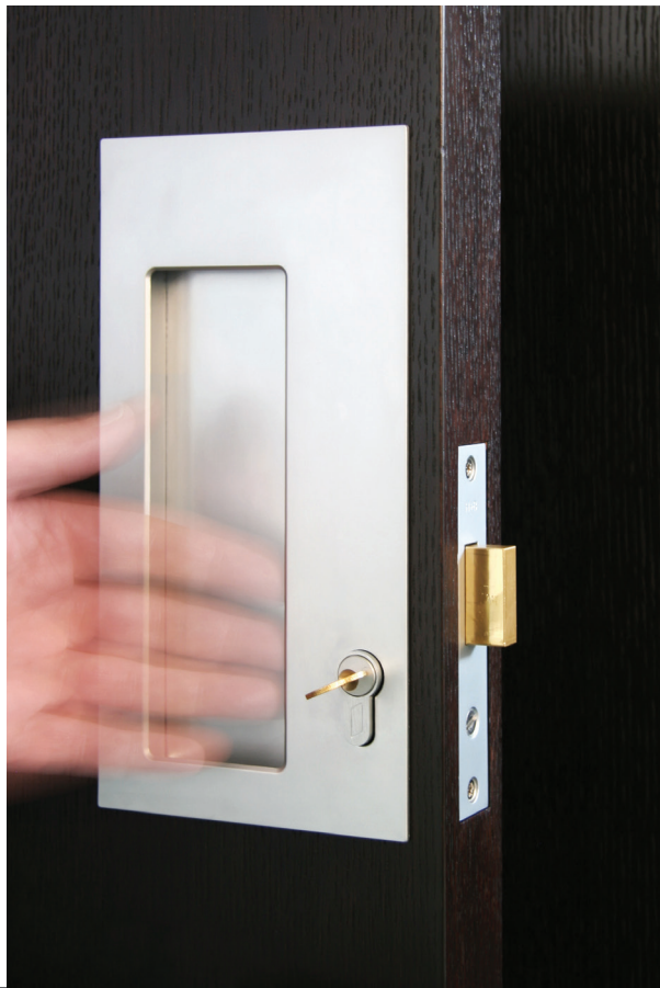
left hand flush pull shown

Available in all standard Halliday + Baillie finishes, see finishes sheet for further details.