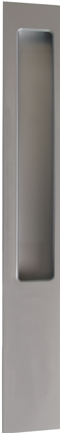
right hand pull shown

Available in all standard Halliday + Baillie finishes. See finishes sheet for further details.