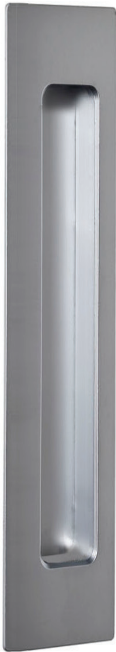
Right Hand Pull showing, also available Left Handed

Available in all standard Halliday + Baillie finishes. See finishes sheet for further details.