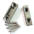
To be used with the HB 604 Timber fixing Kit on timber doors