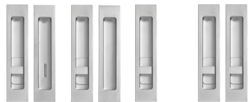
Snib/Key HB 690 configuration Snib/Indicator HB 692 configuration Snib/Blank HB 693 configuration Snib/Snib HB 694 configuration