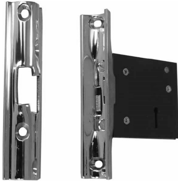
JMHSL 546A Astragal

The JMHSL 546 & 560 are 5 lever claw type sliding locks with good security. No protruding cylinder enables the door to slide flush into the door cavity. The claws are flush when unlocked. Can be keyed alike with other 5 lever locks but only to certain key profiles. Small lock body size for minimum wood removal. Forend & striker made from stainless steel in satin stainless steel finish.